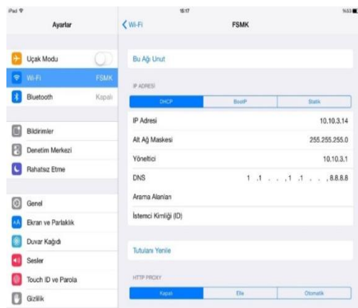
Figure-0 Wireless Network Information

In Figure-4, after entry and certification (Figure-2 and Figure-4),user Mehmet Kosem, in the 802.1x standard test, His identity was approved Firewall transferred the user according to virtual network number of user to administrative _test virtual network and assigned the user